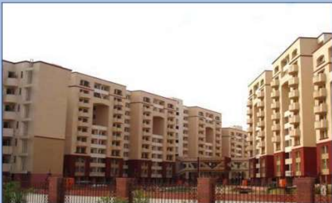
440 Residential Apartments, Sector-19B, Dwarka Phase-II