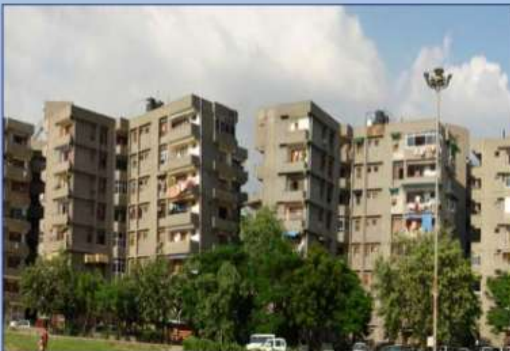
600 Apartments Co-operative Group Housing Society, Pitampura