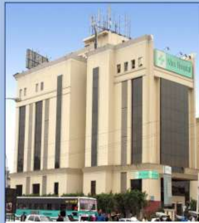
Max Hospital Sector 19 Noida