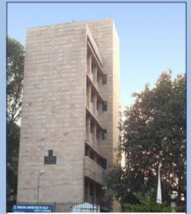
Office Building, R. K. Puram