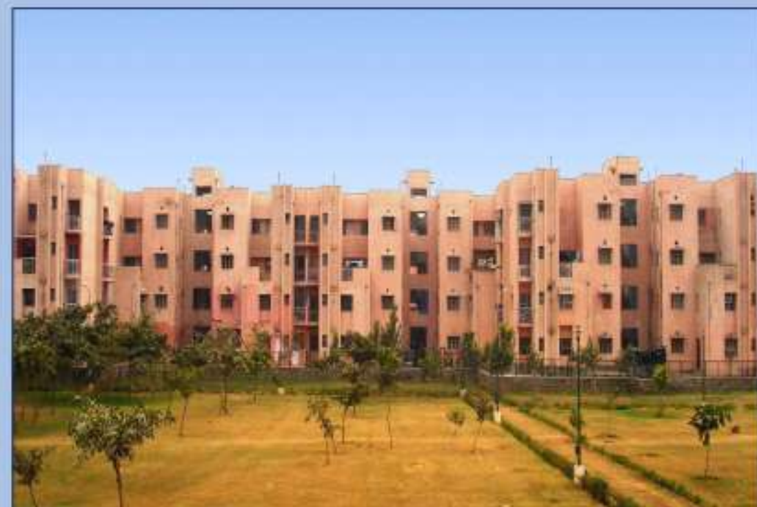
Pocket K & L Residential Apartments, Sarita Vihar, Delhi