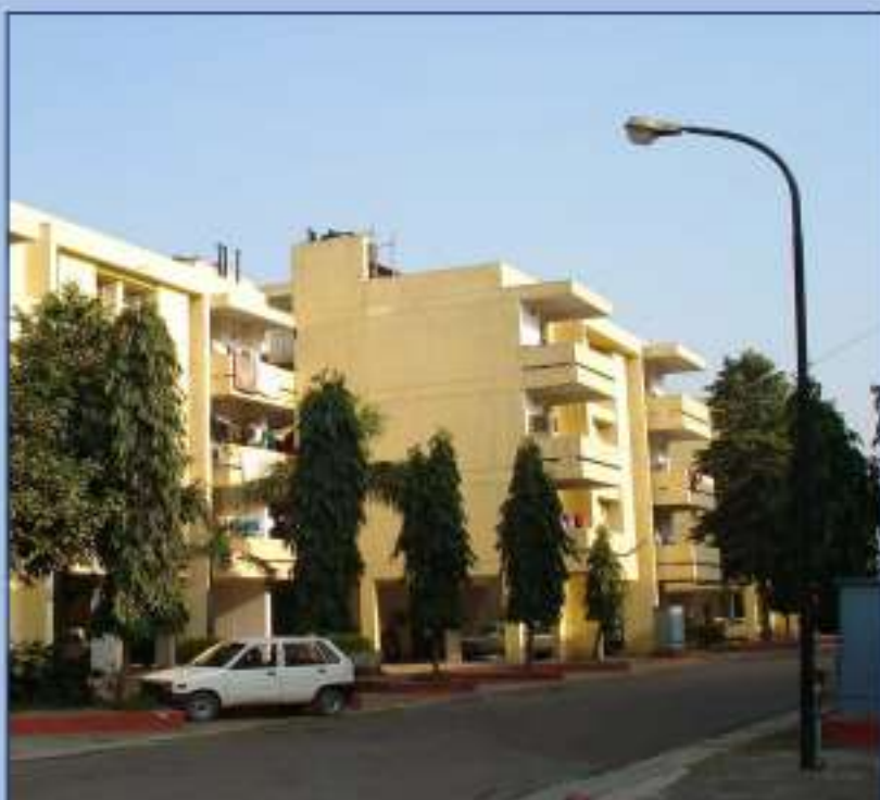
Residential Apartments for RITES India Ltd.