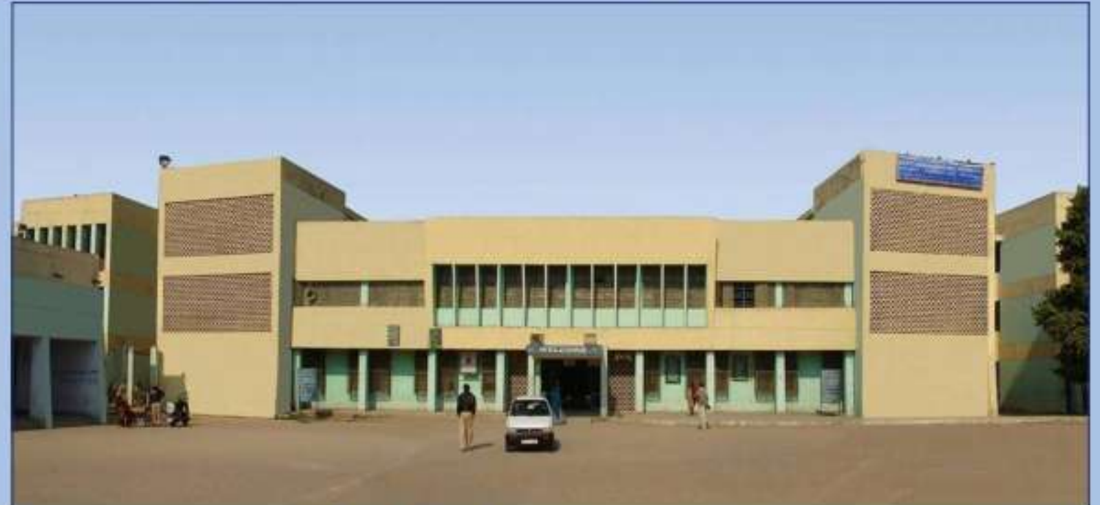
Higher Secondary School, Seemapuri