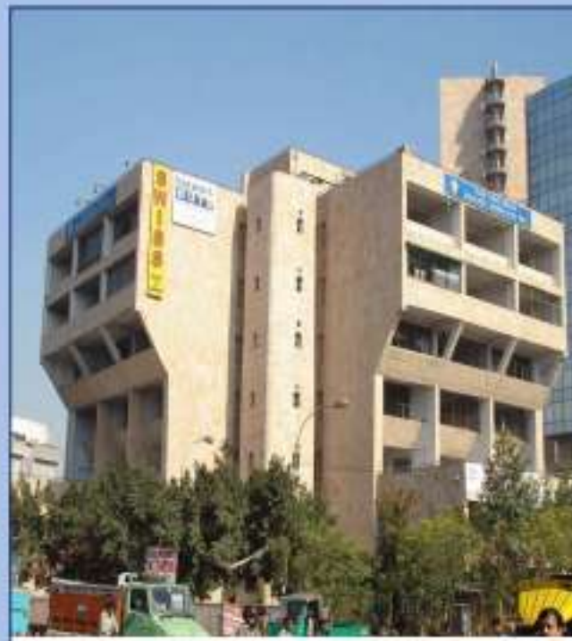
Office Building, Laxmi Nagar