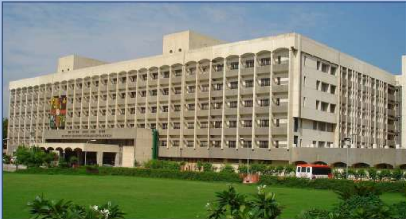
Safdarjung Hospital OPD Wing, New Delhi