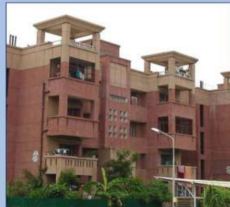
200 Residential Apartments, AIIMS, Ayurvigyan Nagar