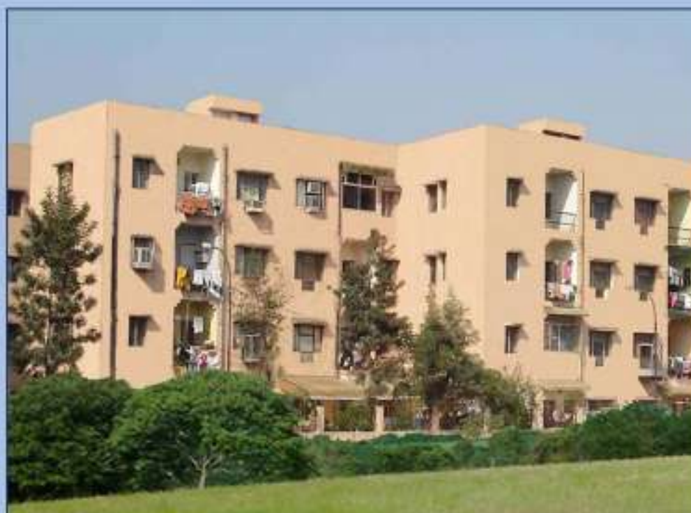
770 Apartments, Sector-18, Rohini, Delhi