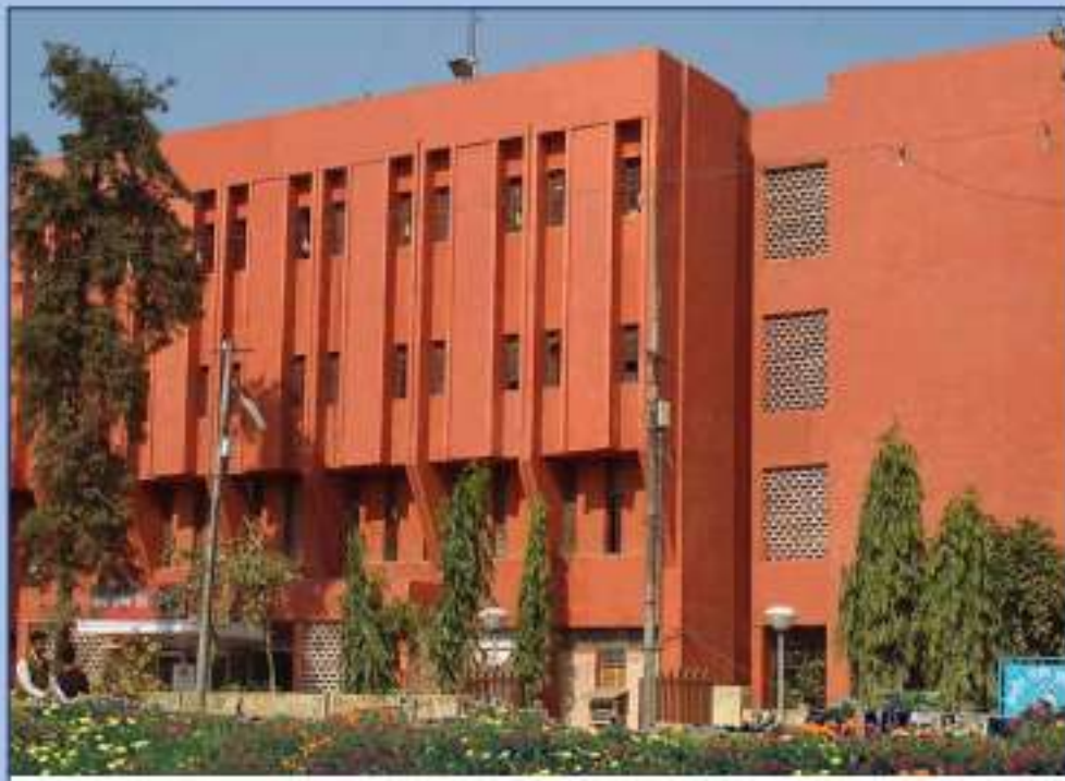
Office building for Police Headquarters, Vivek Vihar